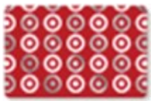
Target Take Charge of

Important Note: Even if you have designated Sacred Heart in the past, these programs require yearly designation!!