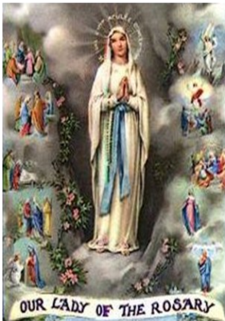
Queen of the Most Holy Rosary, pray for us.